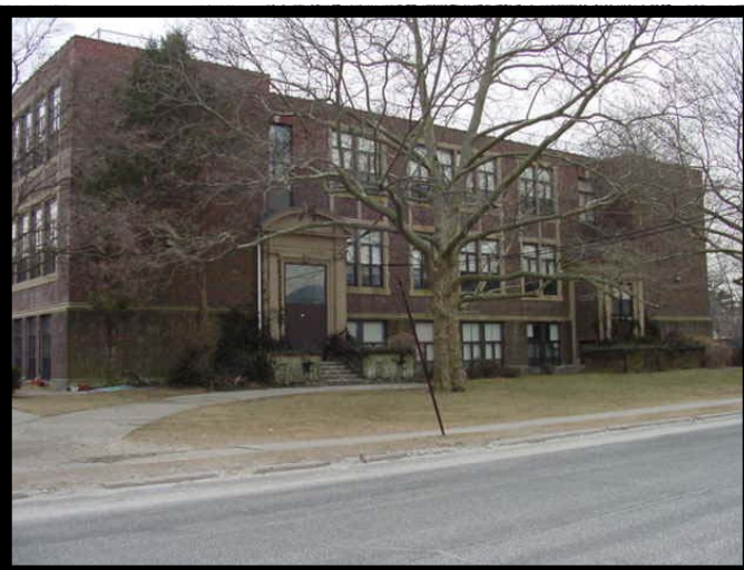
Lincoln Elementary School seen from the front (top) and rear (bottom) today. The 1923 building still stands on Ninth Avenue in Huntington Station and is known as Lincoln Farms Apartments.