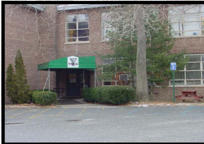
The rear of the old Village Green School now serves as the entrance to the YMCA. The site is now houses a senior citizen program, a pre-school, a movie theatre and various other programs. Most of the original windows are still in place today.

J. Taylor Finley Middle School (right) has served the district well since the mid-1960's, housing many different grade levels, including seventh and eighth grades today. It features a typical post war design and has spacious athletic fields behind it.