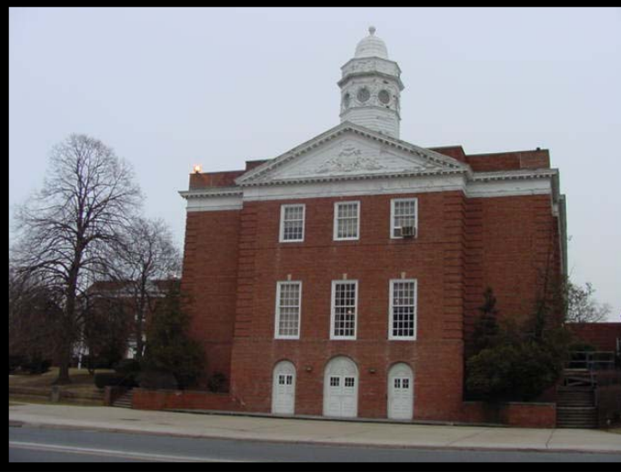
Robert K. Toaz Junior High School was built in 1939 and named after a longtime Huntington Superintendent of Schools. Today, the building still sits majestically in place, although the paint atop the facade and cupola at the Nassau Road entrance is peeling. Large wings of classrooms are not visible.

J. Taylor Finley Junior High School opened in 1965 and is located on Greenlawn Road, about a half mile from Park Avenue off Route 25A. During its history, Finley has also contained a full (2 classes per grade) elementary school and half the sixth grades in the district. It sits on a large, beautiful plot. One of its features was a 300 seat large group instruction room. Today, it retains its modern look.