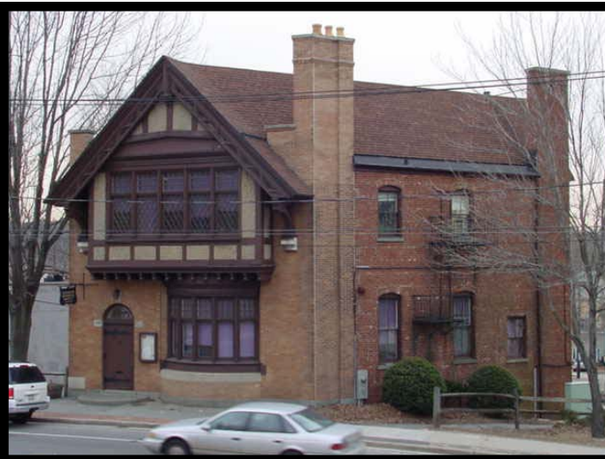
The Sewing and Trade Building at 209 Main Street was first used as a school for girls to learn sewing, cooking, etc. Later boys were admitted. Today it is owned by the Huntington Historical Society.

J. Taylor Finley Junior High School opened in 1965 and is located on Greenlawn Road, about a half mile from Park Avenue off Route 25A. During its history, Finley has also contained a full (2 classes per grade) elementary school and half the sixth grades in the district. It sits on a large, beautiful plot. One of its features was a 300 seat large group instruction room. Today, it retains its modern look.