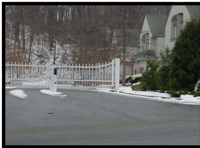
Condominiums now stand behind a large gate at the site where Woodbury Avenue School was located. It served district students for 47 years.

L incoln School was almost the twin of Woodbury Avenue School . It was constructed in 1923 on 9 th Avenue in Huntington Station and originally housed K-8 students. Later it became a K-6 school. Like Woodbury Avenue, Lincoln featured two classes for each grade. When it closed in the early 1970's it was rented out for use as school serving youngsters with special educational needs. It was finally sold and converted to a thirty apartment complex. Very little has been done to the exterior of the building and it could be mistaken today as a functioning school. It sits on a small piece of property on the south side of 9th Avenue, adjacent to the St. Hugh of Lincoln Church. Lincoln School served Huntington School District children for almost 50 years.