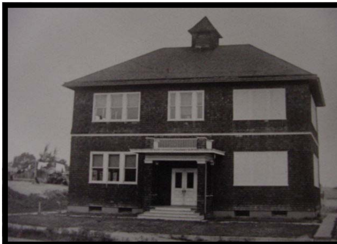
School Street School in Huntington Station was built for $6,500 in 1906 and closed its classrooms in 1913. It later became a post office and VFW Hall before it was demolished in 1968.